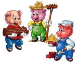
The Three Little Pigs

Please discuss with your child the characters in the story and the different events that happen.